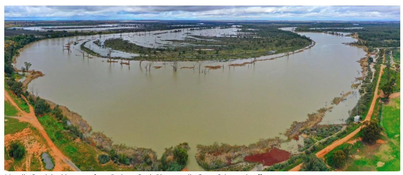
Mundic Creek looking over from Paringa Oval.